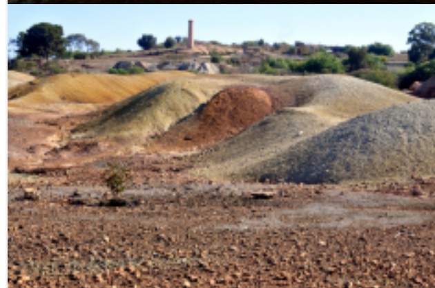
Eyre & Yorke Peninsulas, and the Gawler Ranges