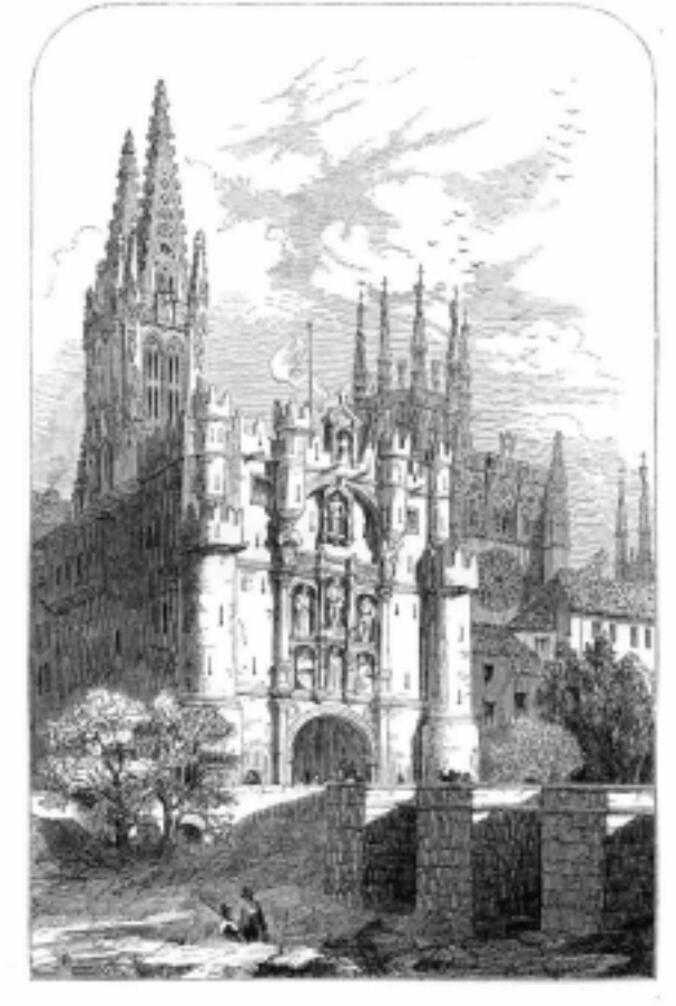
PUERTA DE SANTA MARIA.