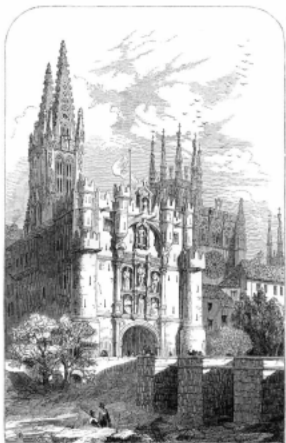
Puerta de Santa María