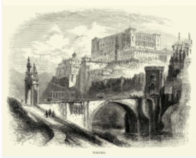
Habsburg Spain vs Tudor England: small group tour exploring 16th century history of England & Spain