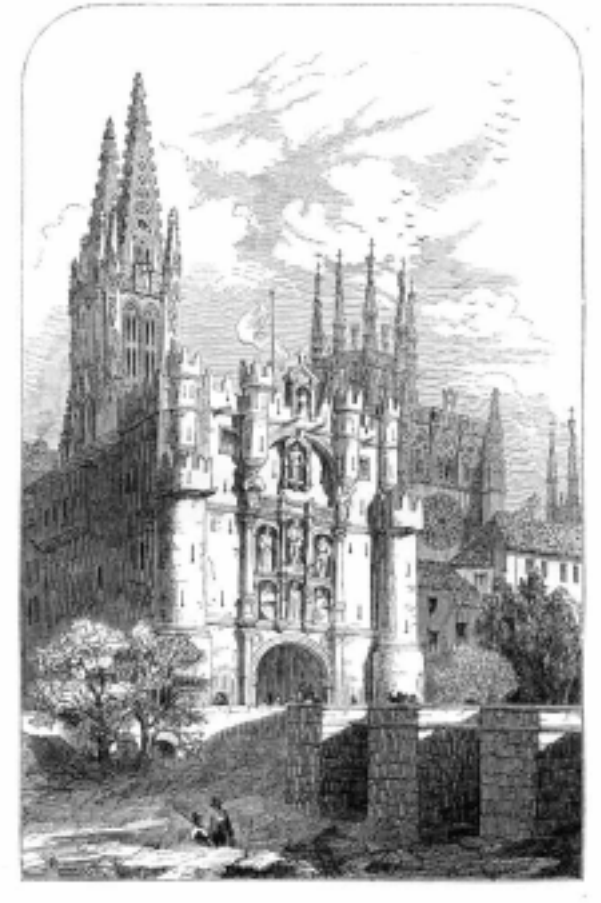
PUERTA DE SANTA MARIA